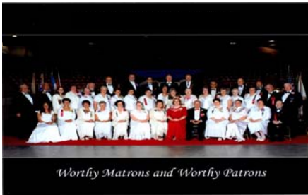
Worthy Matrons & Worthy Patrons from the BC & Yukon Chapters at Grand Chapter

In British Columbia and Yukon, the chapters meet annually at 'Grand Chapter' located in various provincial cities to make and renew friendships; coordinate area projects; elect Provincial officers; and enjoy social activities. The elected chair of Grand Chapter is called the Worthy Grand Matron and the officers are called the Grand Officers, each with individual roles and responsibilities. This worldwide organization allows its members to have caring friends wherever they travel.