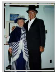
Period costume worn at Vancouver 100th anniversary

As Eastern Star members, we are proud of our Order's heritage, our commitment to cancer, the welfare of the cancer patients and our support of the major cancer centers in British Columbia. The BC Cancer Agency can attest to this. Thousands of members have contributed their time, energy and wisdom in unselfish service to the Order. It is through this fraternal service to humanity that together we build a better life for all.