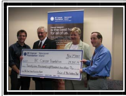
Presentation of cheque to BC Cancer Foundation