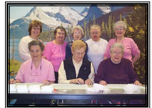
Making cancer dressings

To date the Foster Secretaries cancelled stamp project has raised over $379,000 which was donated to cancer. We cut and prepare cancelled stamps for sale and some of the proceeds are used to purchase supplies to make and donate dressings for cancer patients.