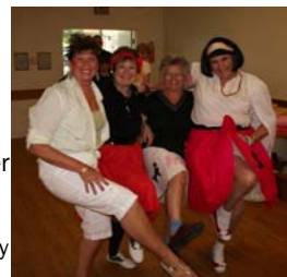
Rock 'n Roll Dance Fund Raiser